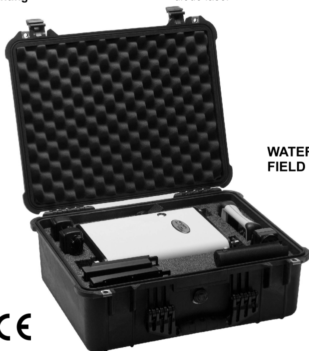
WATERTIGHT FIELD CASE